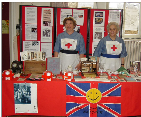
The Red Cross Exhibit