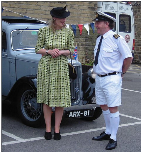
The Navy Was in Town As Well