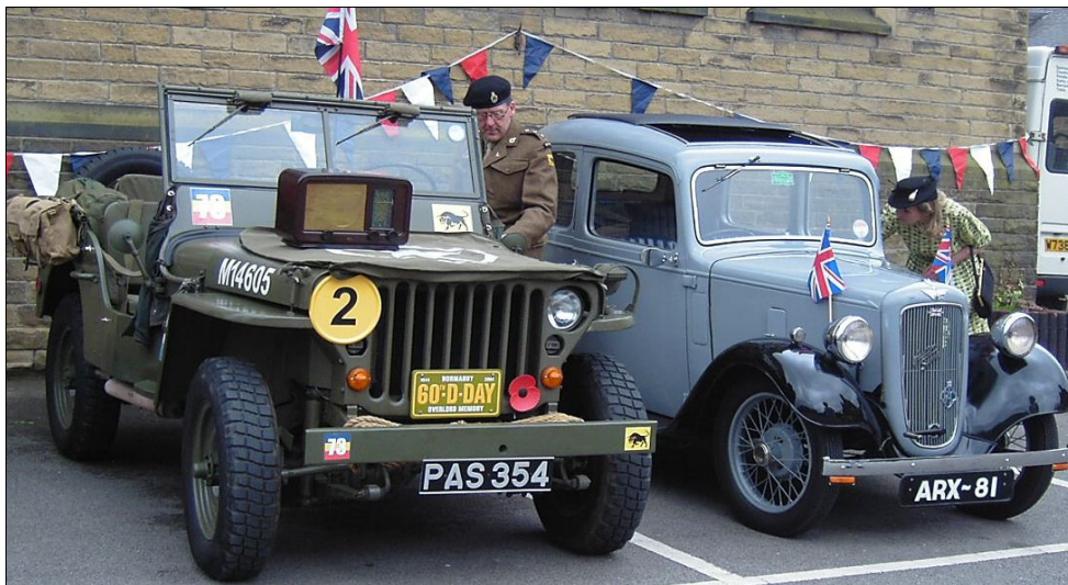
Two of the period vehicles on display at the Community Centre