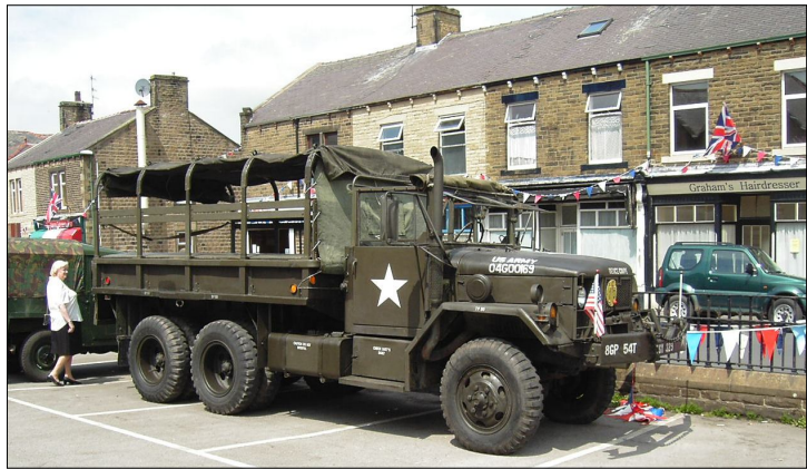
The Yanks are in Town