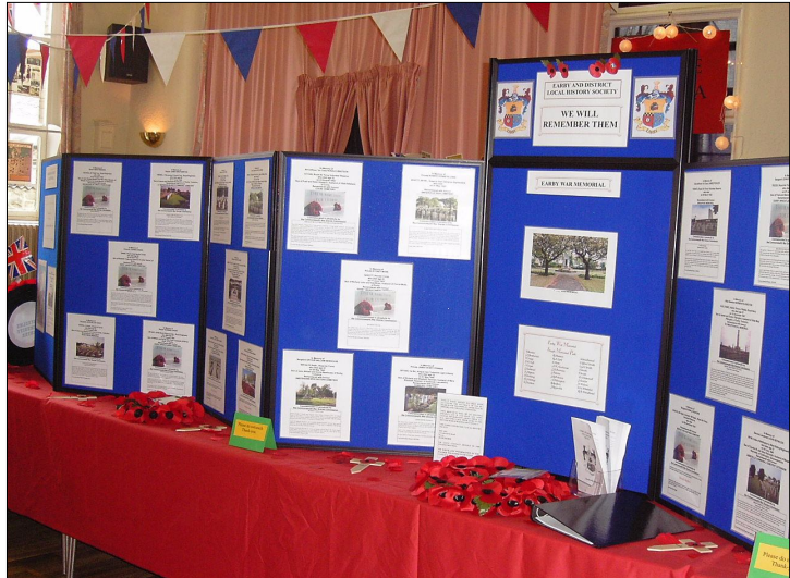
Part of the Society's Exhibit