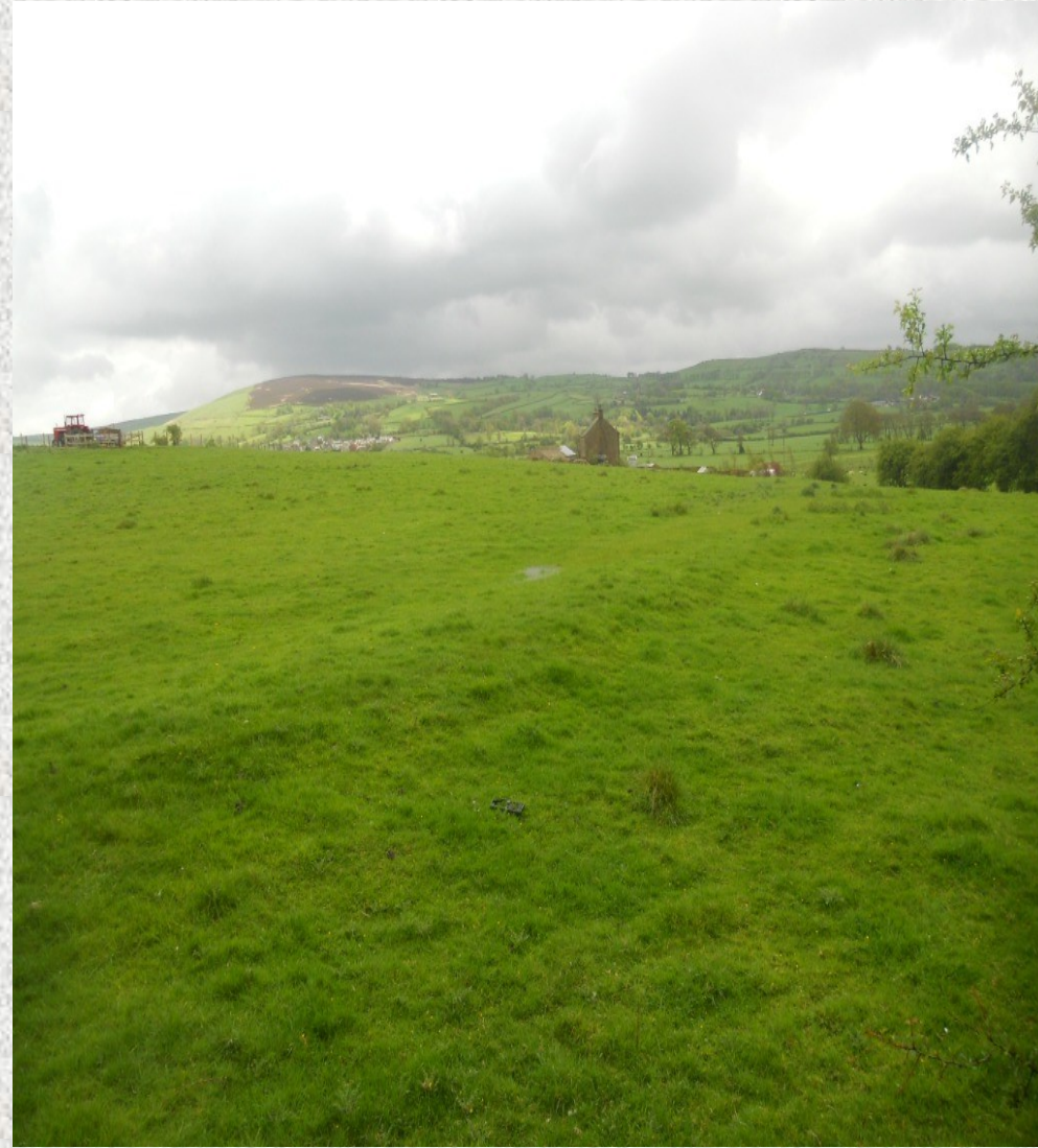
Outline of base for rail track from canal, past Bashfield farm to cordite store