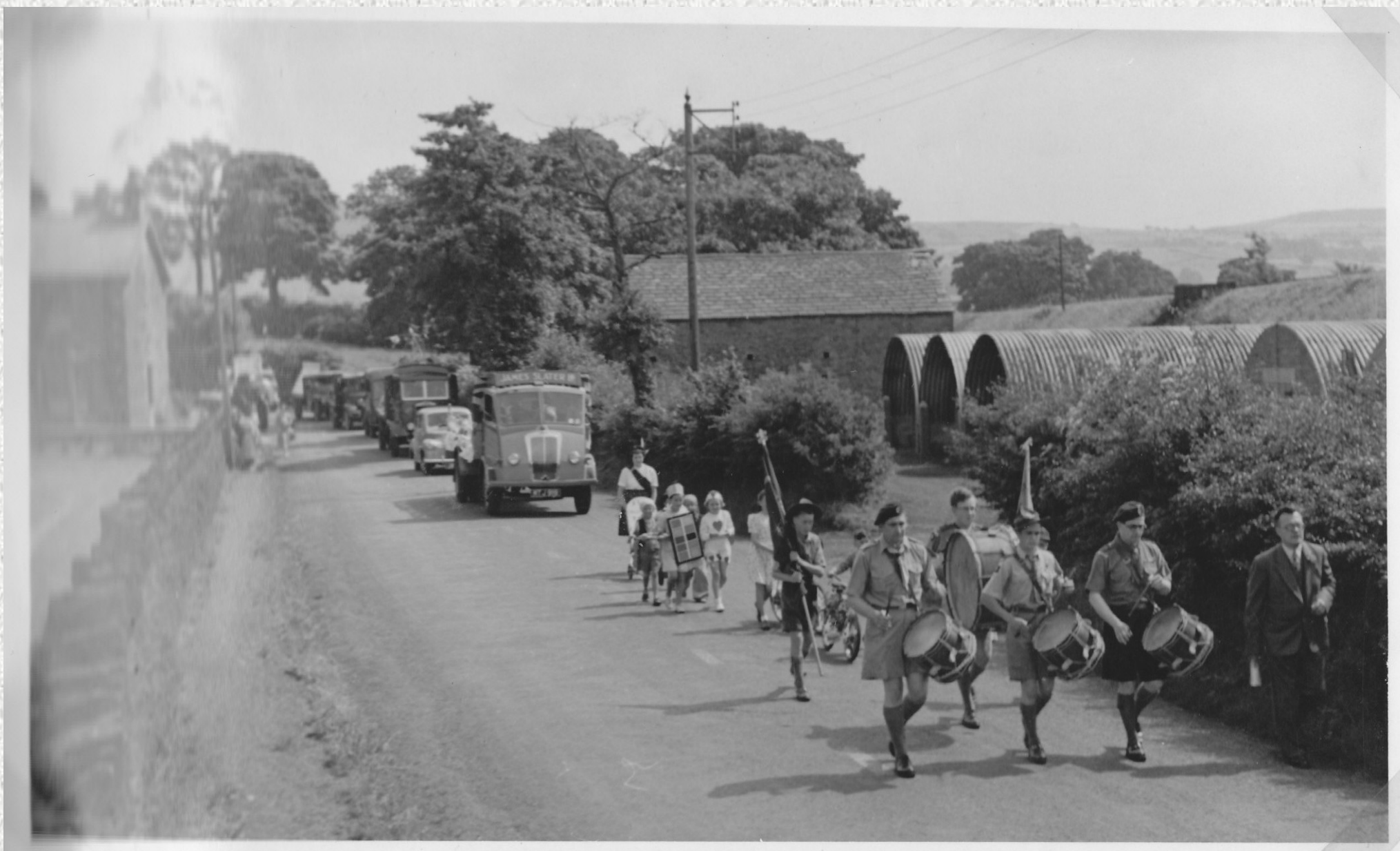
Garage at Klondyke the mizen huts (right) are said to have been from the cordite store