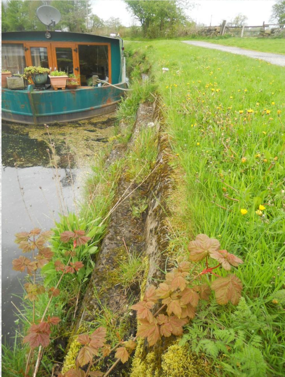
Concrete wall as requested in letter

Transcript of letter re Mr Marriott, munitions committee.