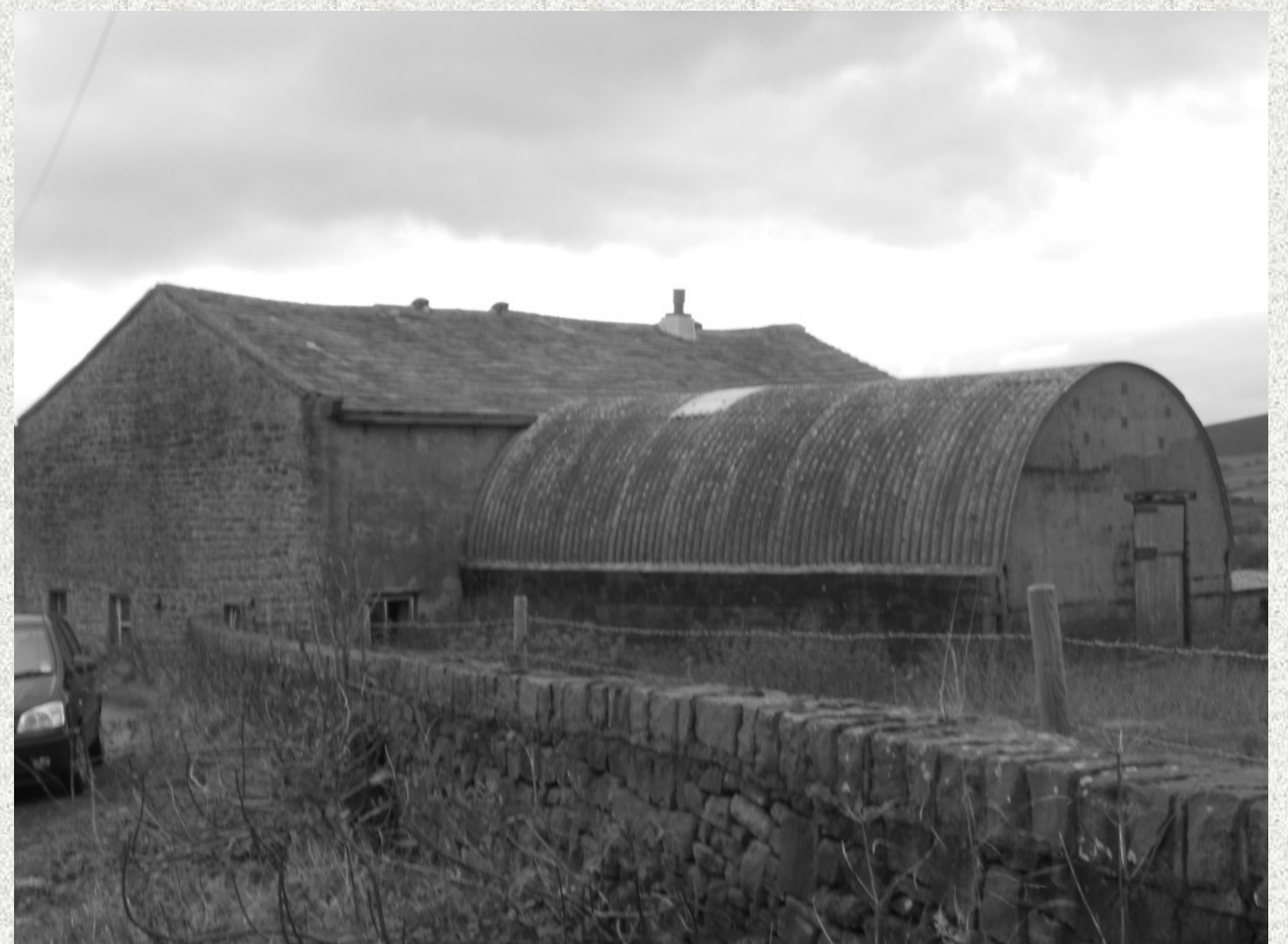
White House Farm, Salterforth showing another nizen hut thought to be from the cordite store