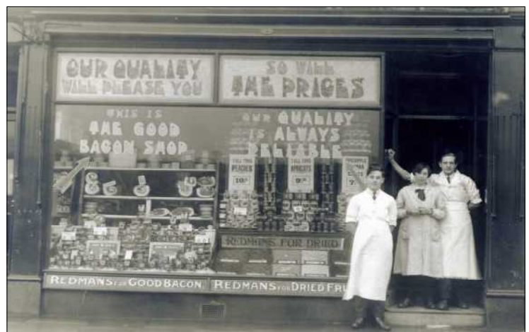
Earby Redmans 1932