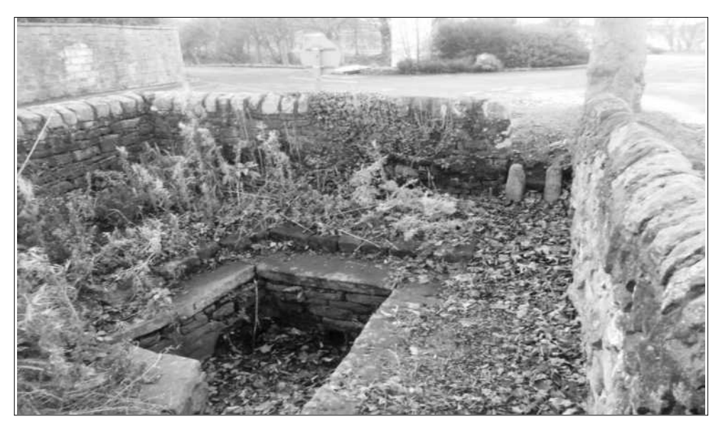
Ginny's Well in the Car Park at Salterforth

skinned, with long hair, and sharp teeth. Mothers would tell the story to their children to make them refrain from going near the well with the fear of drowning.