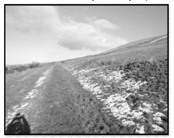
Track in snow and track

It appears from the minutes that in 1930 the council were erecting a very substantial fence along a line above the track along the Banks to a point above Moor Hall Farm, so substantial indeed that in our youth we could not scale it. The final minute on this subject refers to the need for a stile over the fence. We will return to this subject later to explain the need for this fence, but we now appear to have a trail of information to explain the wanderings of our guide stoop from its removal by Dick Sprout's gang from its putative original site on this track from Kelbrook to Stoneybank. This would give us a position of the track where it joins another track "Shuttleworth Lane" which leads down through Moor Hall Farm past Barnwood to Rostle Top Lane and on up Salterforth Lane towards Barnoldswick and eventually to Blackburn. The old salters route. An early and very important route.