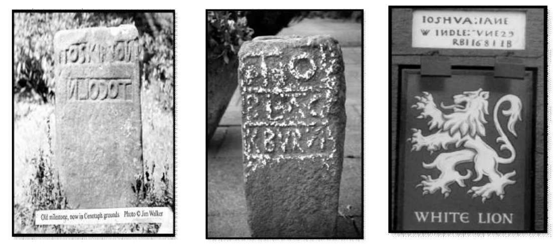
Guide Stoop and White Lion Sign

Our guide stoop is very unusual in several respects – it has no mileages, one destination is in mirror writing to indicate direction, and it is carved in relief rather than incised in a distinctive style virtually identical to that over the door of the White Lion (1681) and probably by the same stone mason – note the reversed "N's". This would date our stoop to very close to 1700.