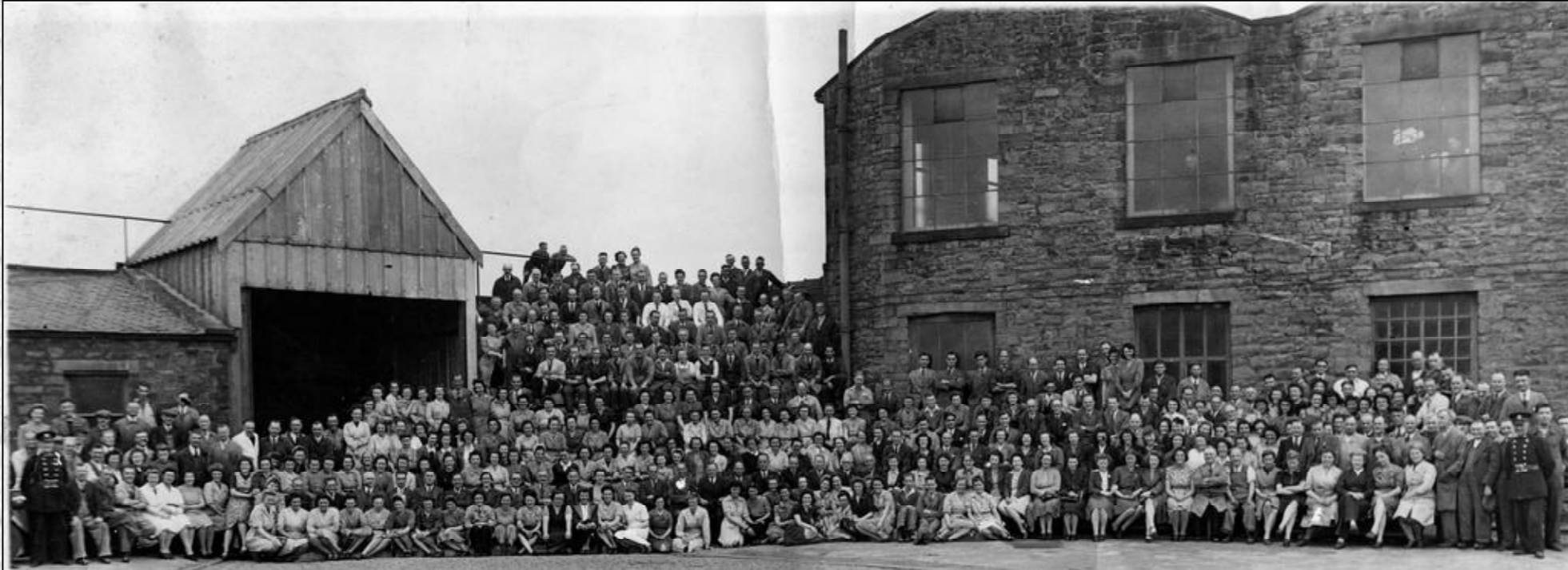
With the Appreciation of the management of the Rover Company Ltd., for our Joint War Effort 1939-45 SOUGH BRIDGE MILL

The Northolme Estate was central in respect to the shadow factories at Grove Mill, Sough Bridge Mill and Bankfield Mill, Carleton Mill further to the east.