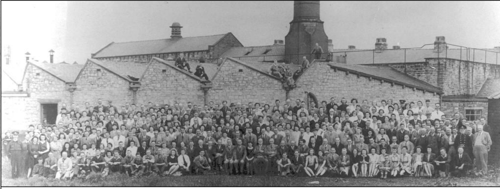
With the Appreciation of the management of the Rover Company Ltd., for our Joint War Effort 1939-45 GROVE MILL