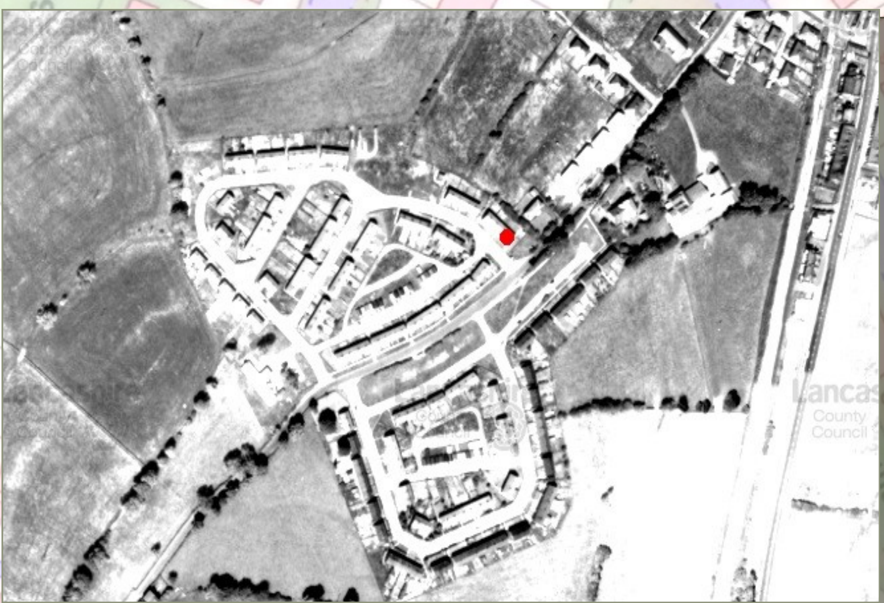
1960's Aerial photograph Showing the completed Council Housing