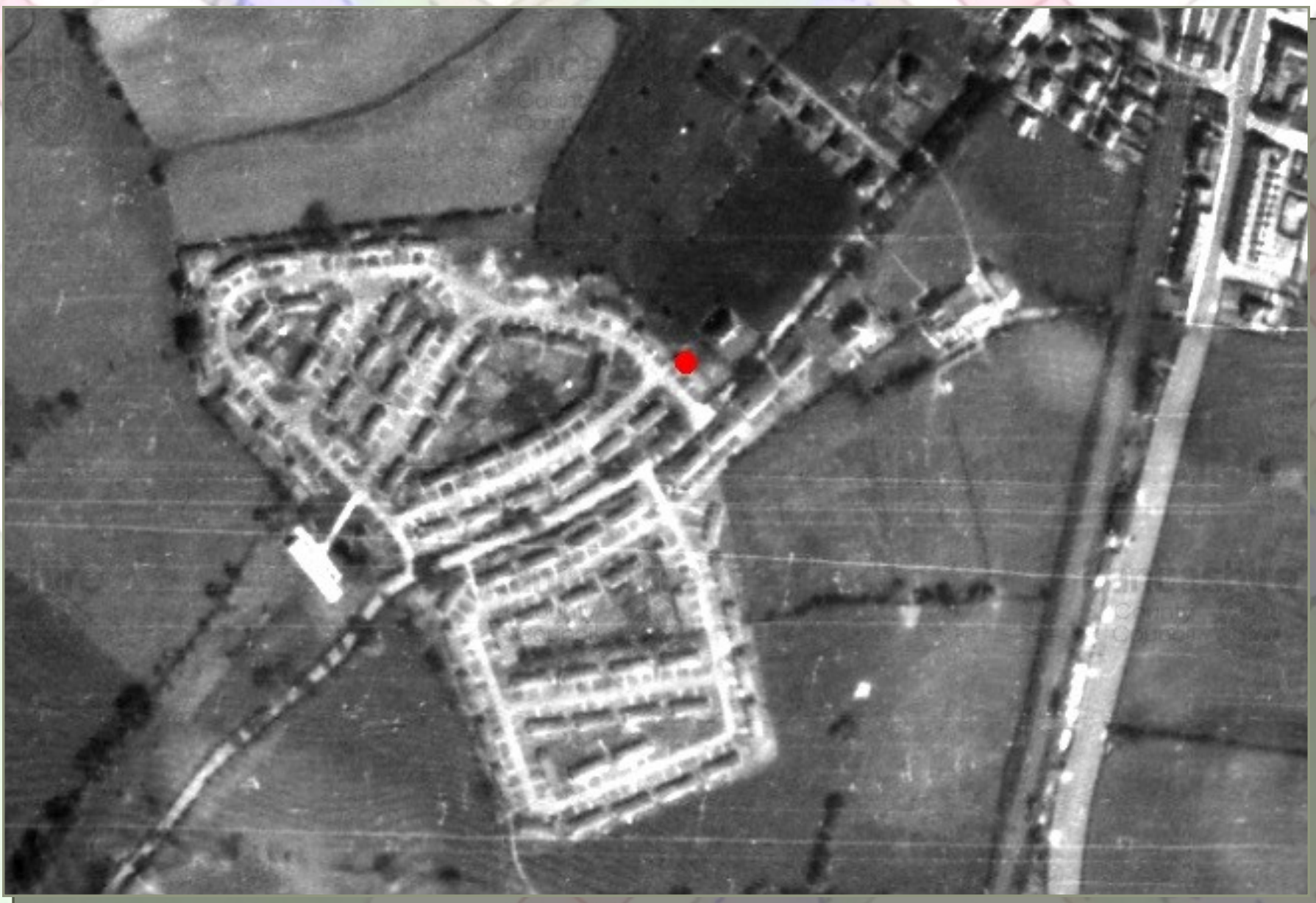
1940's aerial photograph Showing the prefabricated housing