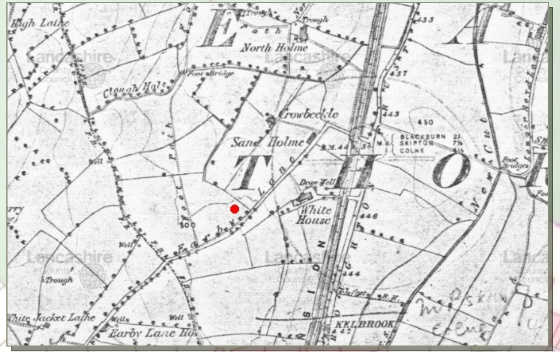
1850 Map showing the fields before anything was built