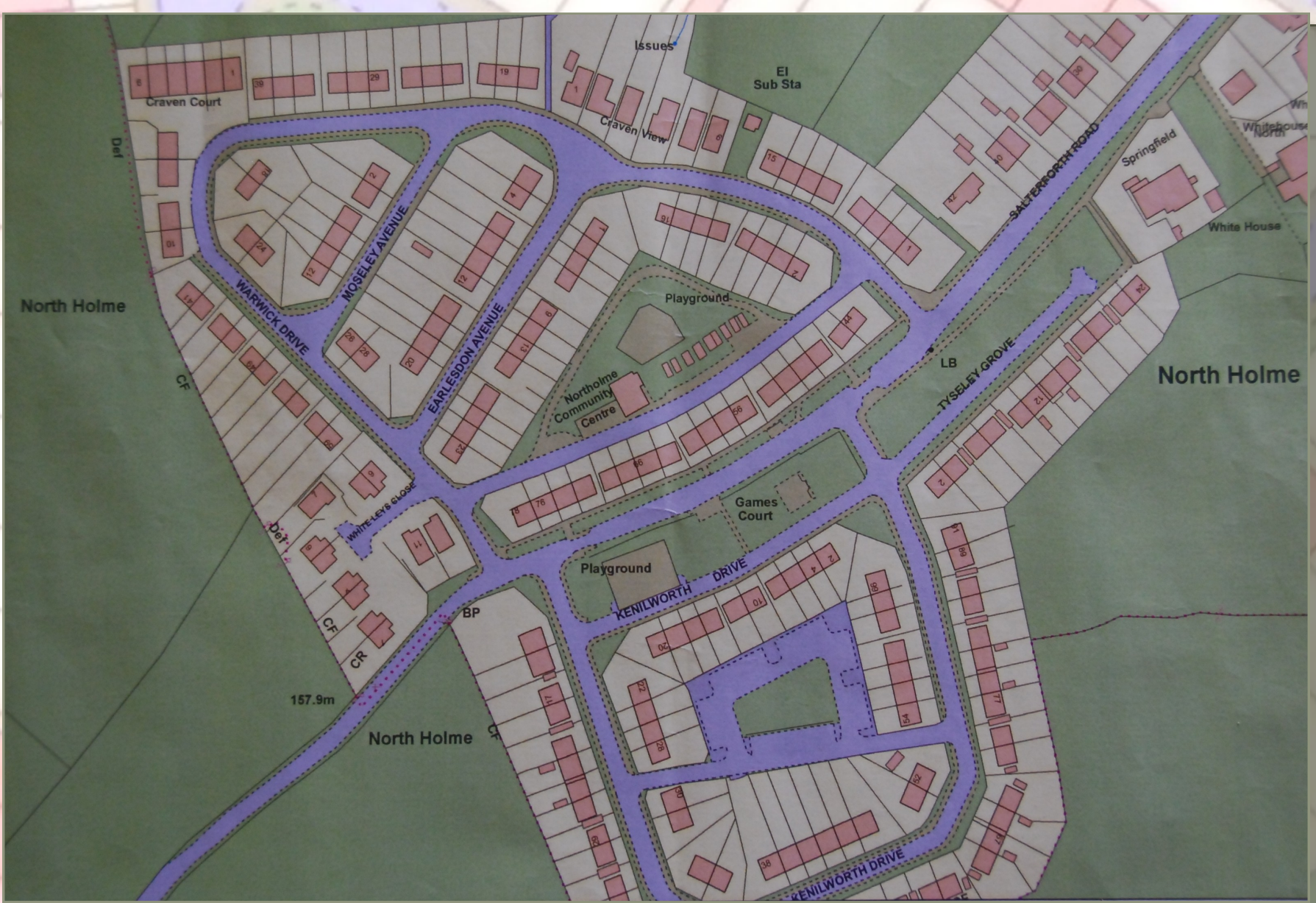
Up to Date Pendle Borough Council Survey Map